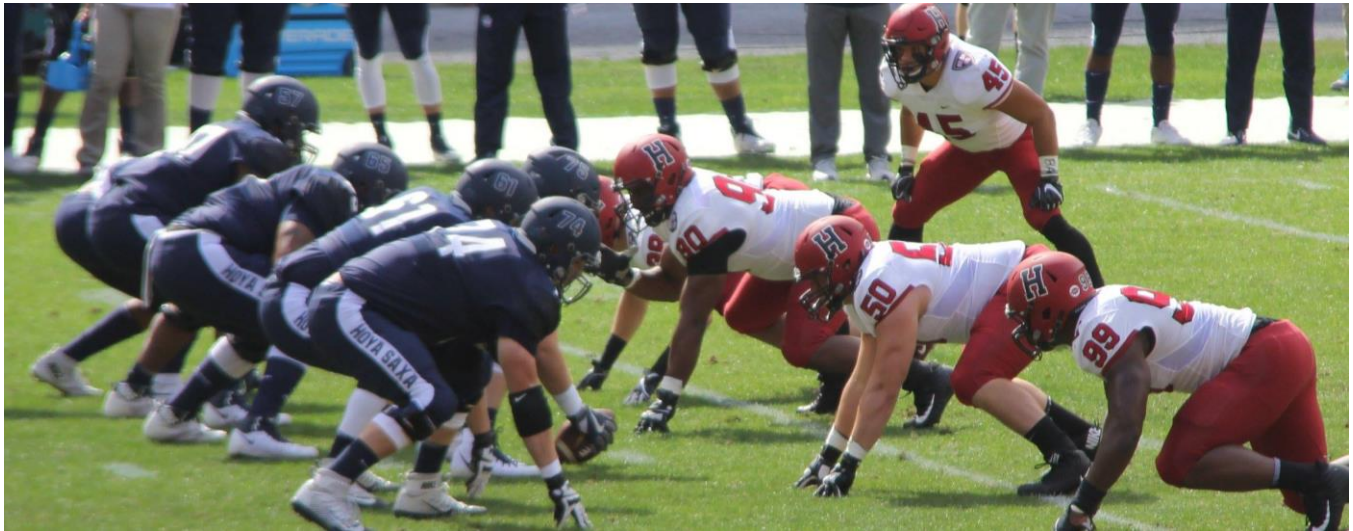
Harvard-Georgetown Football Game at RFK Stadium