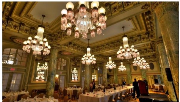
Willard InterContinental Crystal Room