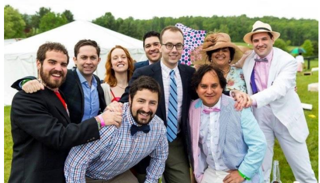
Harvard Club at the 2017 Virginia Gold Cup